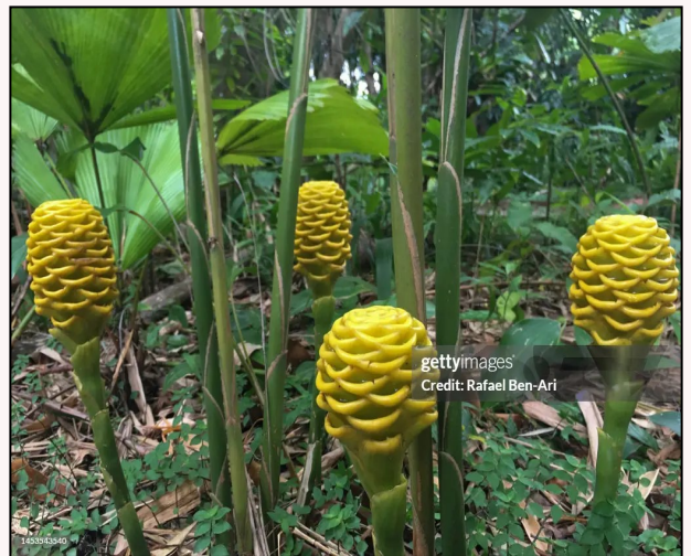
Yellow coned pinecone ginger

In my garden, it has always been a plant that visitors are curious about. Many times they leave with a baby pinecone ginger in hand.